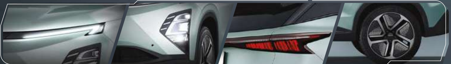
LED Daytime Running Lamp (DRL)