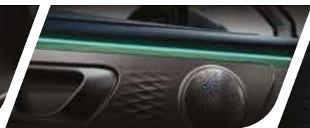
64 Multi-Colours Ambient Lights