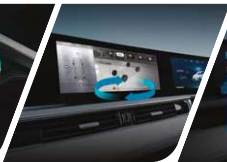
540° HD Panoramic Camera