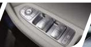
Power All Window