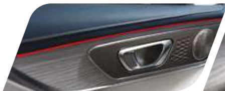
Multi-Colour Interior with Soft Touch Material