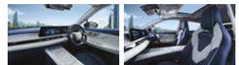
Blue & Beige