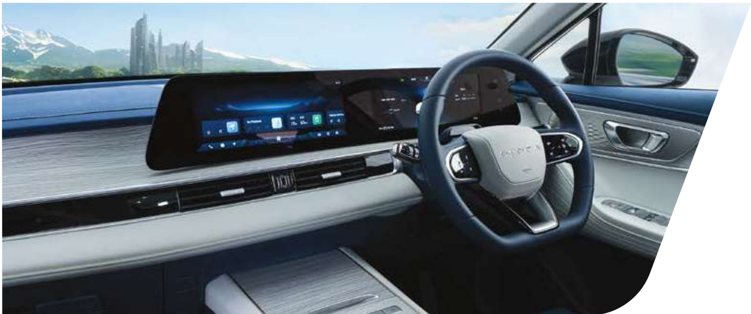
Futuristic Cabin with 24.6 inch Super Large Curved Screen