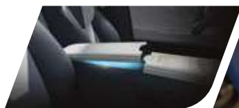
Front Armrest with Cooling System