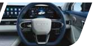
Multi-Function Steering Wheel