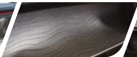
Special Wood Panel Dashboard