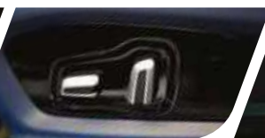
Driver and Passenger Electric Seat Adjuster