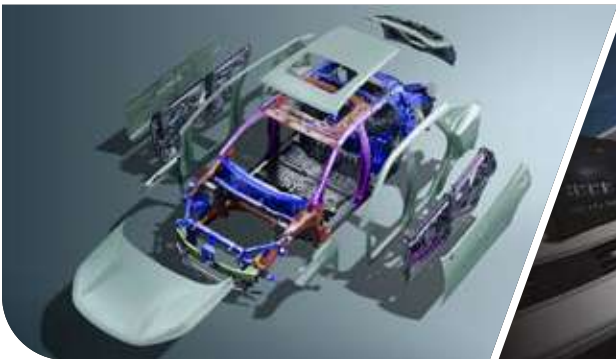
78% High-Strength Steel Body with Collision Dampening Point