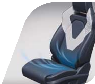
Driver & Passenger Ventilated Seat