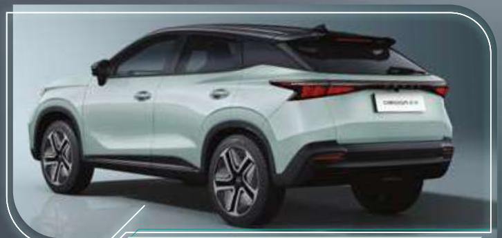
Light & Shadow Cutting Streamlined Body