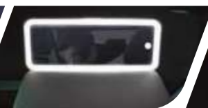
Futuristic Sunvisor with New Tech-Light System