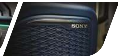
Sony B Speakers