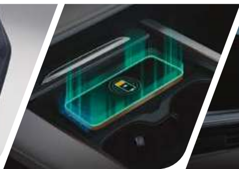
50w Wireless Charger with Cooling System