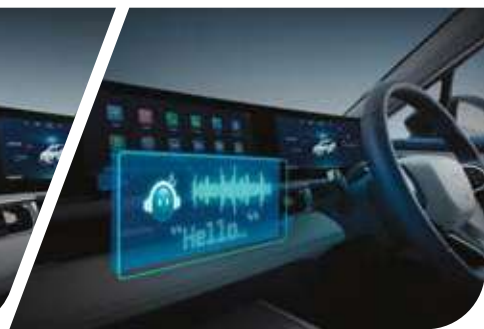
Intelligent Voice Assistant