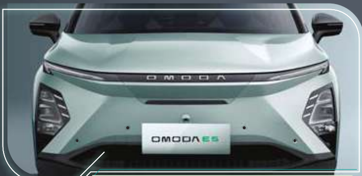
X Future Tech Front